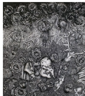
Lauren Nelson '16 "Whimsy" india ink & micron pen; 18" x 20"