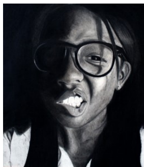
A'rian McGhee '16 "Self-Portrait" charcoal, 15.5" x 18"