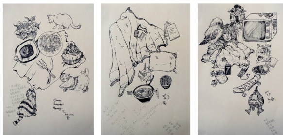
Yaer "Vivian" Han '16 "Everyday" graphite & pen and ink, 3; 7" x 10"

Students are invited to brighten up the month with a Red, White and Blue Spirit Day on Wednesday, February 25 . Show your colors and come out of uniform!